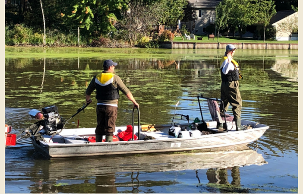
Phase 1: Phragmites was treated along Mud Creek and the Ausable River Cut.