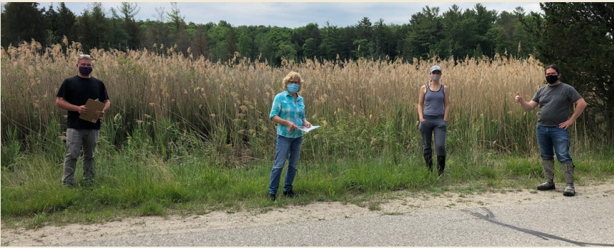
Assessing the work needed in the L Lake wetland along Outer Drive.