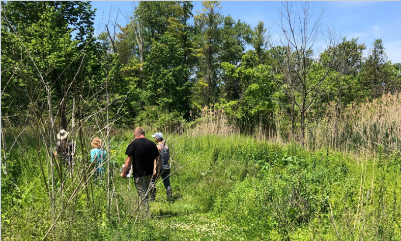
Assessing Mud Creek at the foot of Huron Street

After successful mitigation during Phase 1, we were happy to clear this area of the standing dead Phragmites with the help of the Lambton Shores Nature Trails volunteers at our first ever winter cull in Port Franks. We're looking forward to future successful collaborations. This summer working with LSNT, plans are underway to begin management in Forest. More information to follow - we are looking for volunteers to help us out from the Forest community.