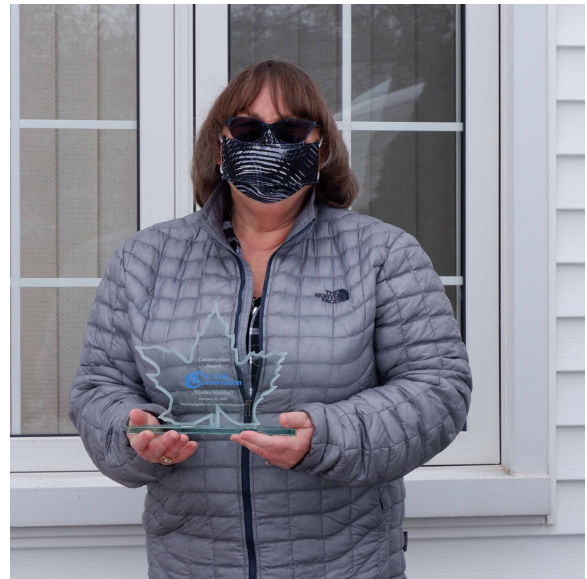
Very well deserved!

LSPCG is recognized as the developer of the watershed approach to Phragmites management, and has used every available method to combat this invasive species since the group's inception. One very key weapon in the fight has been missing - until now. We are so thrilled to learn that we can look forward to an effective herbicide that is approved for use over water - Habitat Aqua. Used effectively in the U.S. for years, this will be a real game changer in the fight here! It has taken years of scientific testing and a long, involved approval process to get to this point. You can learn more about this by visiting Health Canada's website .